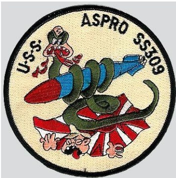
Photo & text from U.S. Submarines Through 1945, An Illustrated Design History , by Norman Friedman (Naval Institute Press, 1995)

Aspro is shown on 24 May 1945 after a refit at Hunters Point (San Francisco Naval Shipyard), California.