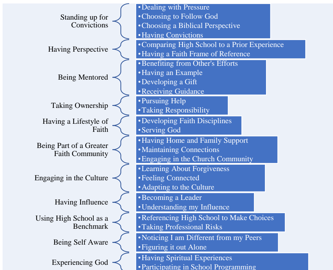
Figure 2. Themes and subthemes for the experience of CSF in the Christian high school.

The principal investigator read through the coded excerpts and placed the categories and subcategories into a hierarchical diagram to get “a handle on them” (Saldaña, 2013, p. 216; Figure 2). The principal investigator combed through the horizons and constructed new codes based on the “comparability and transferability” of the process codes and in vivo codes. The themes emerged from the smaller groupings into the overall themes. The themes overlap and are not mutually exclusive. Once the themes were identified, the primary investigator checked across all eight participant transcripts to see if the experience was shared across all participants’ transcripts (Table 3).