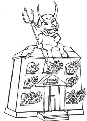
Illustration by Lizz Leizer

First, remember that I am playing devil's advocate here (and give me another paragraph until I talk about how libraries aren't obsolete). Second, assuming that wasn't just an ad hominem attack, this is about the idea that a deficit model isn't a bad one, because there will always be a role for a safety net. The deficit argument isn't against the social safety net, but rather that we can fix the net through mechanisms other than libraries.