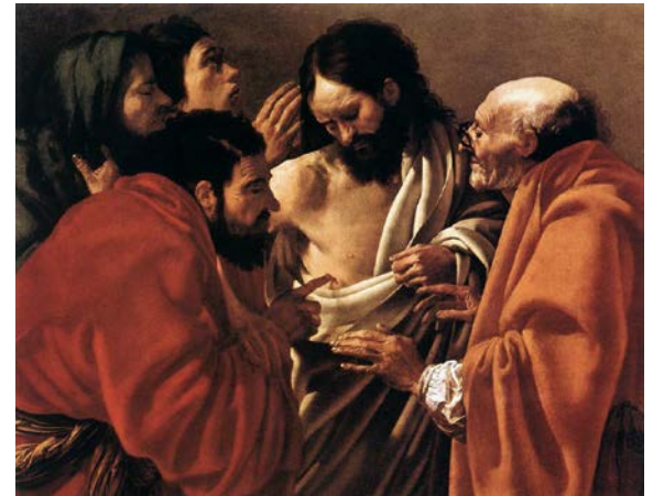
by Henrick der Bruggen 1622