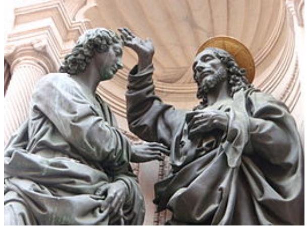
bronze by Verrocchio 1467-83

A week later the scene repeats only this time Thomas is there. Jesus appears. He does not wait for them to explain Thomas or recount his disbelieving words; Jesus immediately walks up to Thomas and confronts him for his unbelief, citing the very words he spoke to his fellow disciples. His words to Thomas are critically important. “Blessed are those who have not seen and yet believe.” Those people, of course are the readers – we are those blessed people! We have encountered Christ in the people who have spoken to us with his Spirit. Jesus has called us blessed in a way that Thomas is not blessed. We have seen him and believed. As Peter praised the people in his first letter, even though they have not seen him, they believe in him and are being saved.