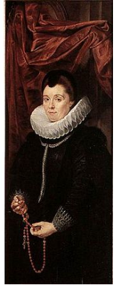
by Peter Paul Rubens c. 1613