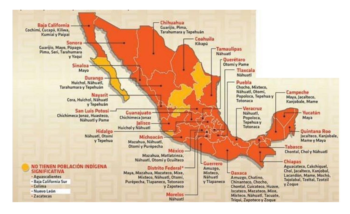
Figure 2: Map of indigenous nationalities of Mexico<sup>5</sup>