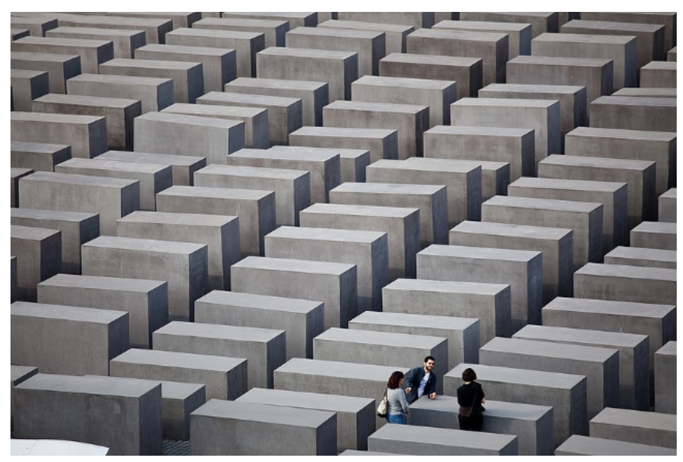
Holocaust Memorial in Berlin, Germany